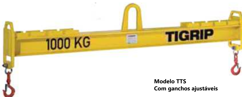
Modelo TTS Com ganchos ajustáveis

O programa standard é complementado por vários modelos especiais feitos a partir de especificações de clientes.