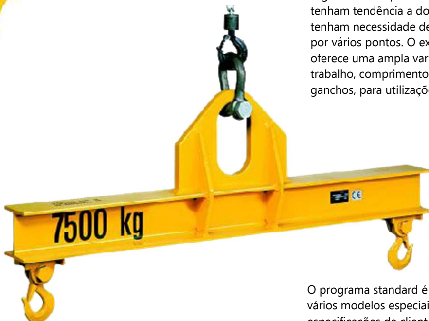
Modelo TTS-E Ganchos não ajustáveis

Os spreaders Tigrip são a forma mais prática e segura de transportar materiais longos que tenham tendência a dobrar, ou para cargas que tenham necessidade de ter o seu peso distribuído por vários pontos. O extenso programa standard oferece uma ampla variedade de cargas de trabalho, comprimentos fixos e variáveis e ganchos, para utilizações correntes.